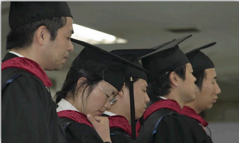
Students from the March 2011 Christ Bible Seminary graduating class. Please pray for this new generation of Christian leaders.

FONTS is a 501(c)(3) non-profit organization (EIN: 20-0289989), and your gift is fully tax-deductible.