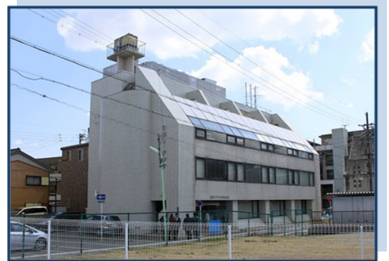
The building recently purchased for CBI ministry.

An engineering report on the building has revealed that the 1st and 2nd floors need reinforcement to strengthen against earthquakes.