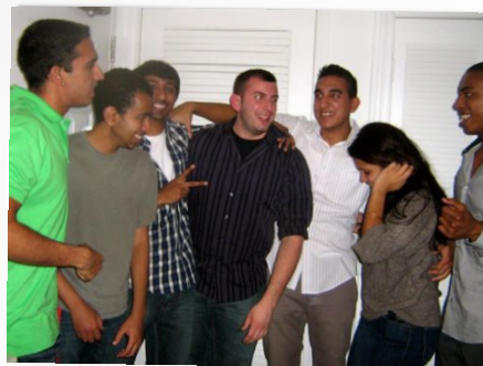
THE ENGINEERS AT UMD