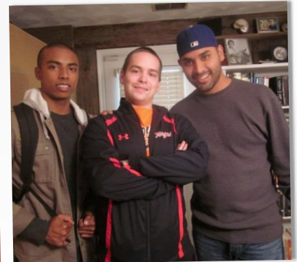
BROTHERS IN THE FAITH