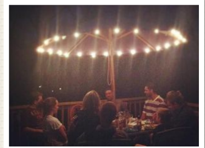
ONEU FAMILY NIGHT