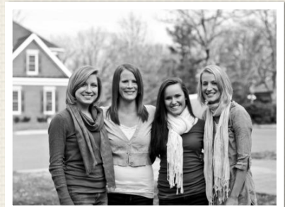
THE LADIES OF ONEU