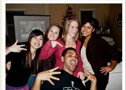
TEAMMATES AND FRIENDS