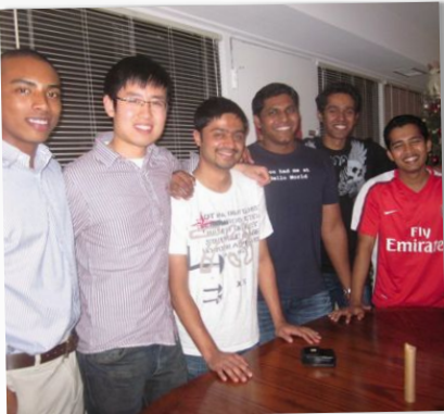
SUNDAY BIBLE STUDY CREW

“Shall not the lamb who was slain receive the full reward of His suffering?”